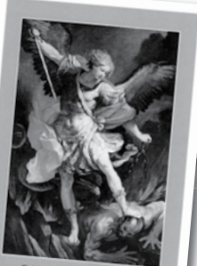
SAINT MICHAEL Pray for us.