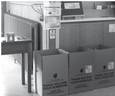
聖神騎士會圓桌 Sheng Shen Knights of Columbus RT

Thank you for your generous donation and participation in the Holiday Food Drive event in the month of December. We collected various non-perishable food that filled three large boxes and five hundred thirty-eight dollars and sixty cents cash ($538.60) donation for the Ottawa Food Bank. We appreciate your love and sharing for the needed. Wish you all with Joy & Peace and lots of blessing from God in 2019.