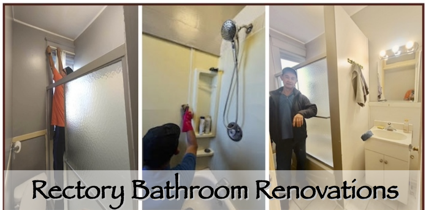
Rectory Bathroom Renovations